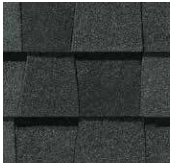
Max Def Moire Black