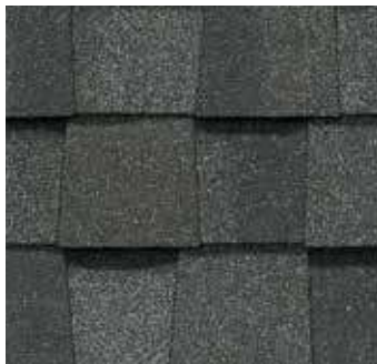
Max Def Pewter