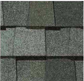
Max Def Granite Gray