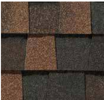
Max Def Burnt Sienna