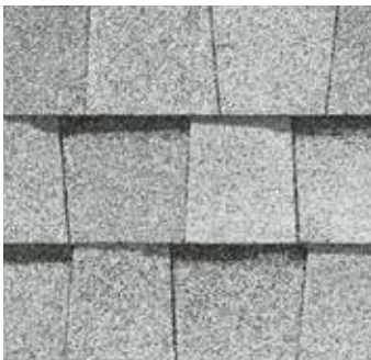
Silver Birch CRR Product ID 0668-0072