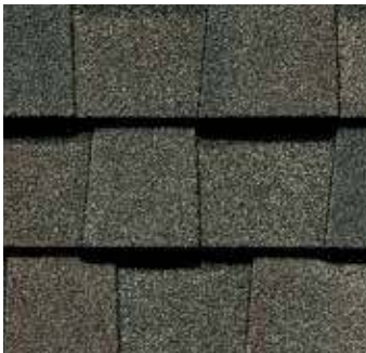
Max Def Driftwood