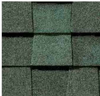
Max Def Hunter Green

NOTE: Due to limitations of printing reproduction, CertainTeed can not guarantee the identical match of the actual product color to the graphic representations throughout this publication.