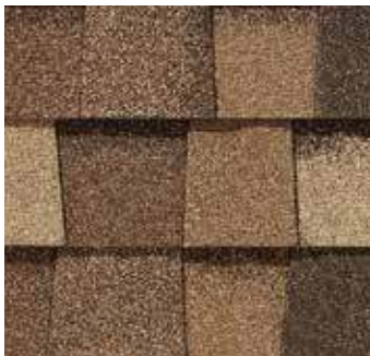
Max Def Resawn Shake