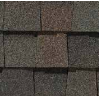
Max Def Heather Blend