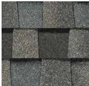
Max Def Weathered Wood