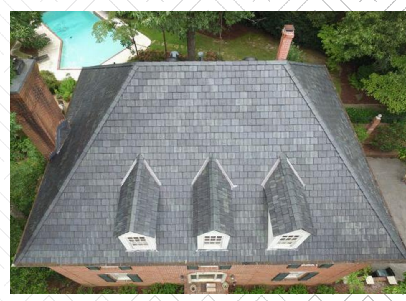
Brava Old World Slate Victorian

Brava uses the most advanced UV protection to guarantee superior long-lasting color.