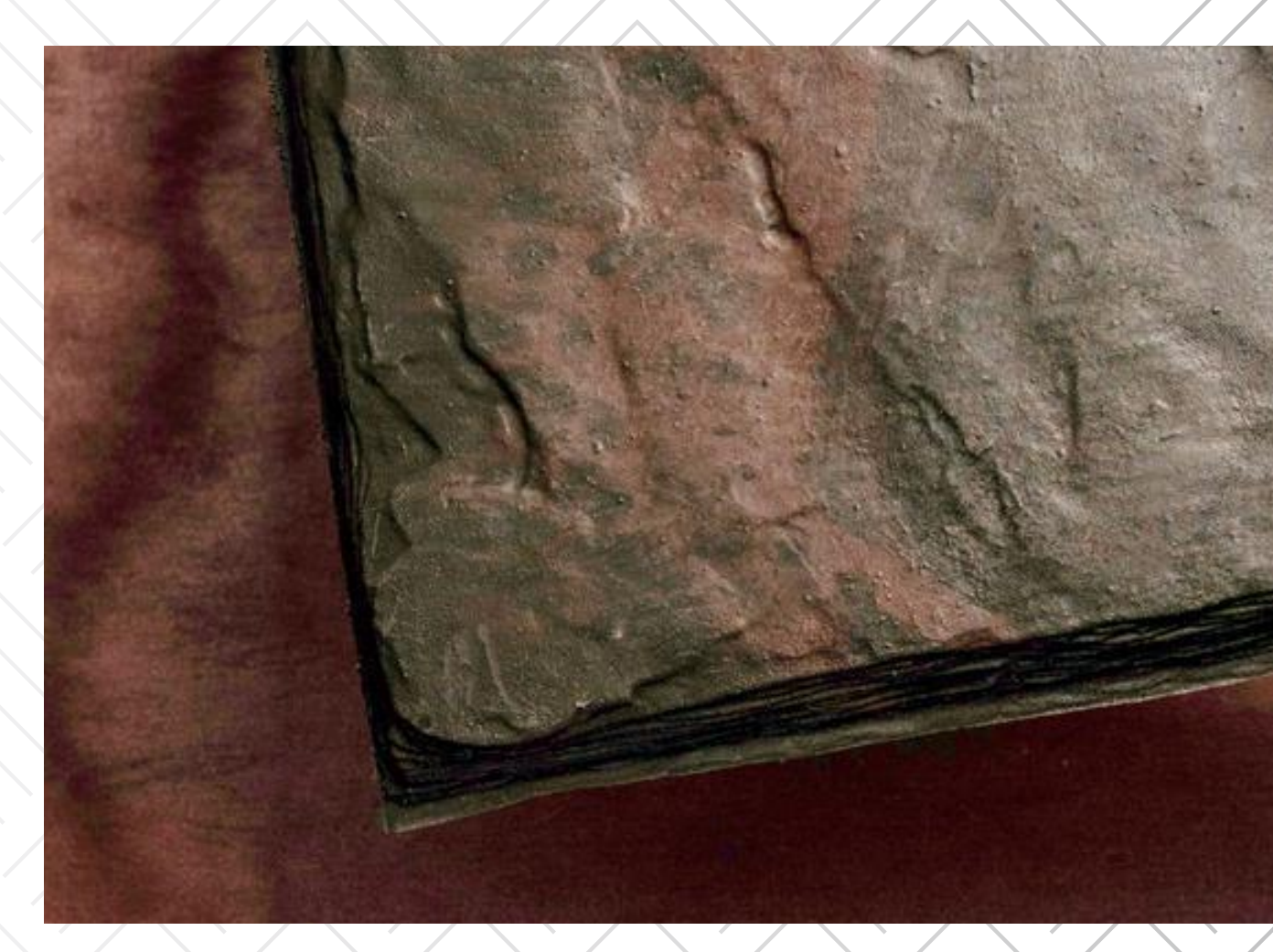
Brava Old World Slate Atlantic

Brava uses state-of the-art compression molding technology. It's this precision of manufacturing that gives Brava Old World Slate its unparalleled strength.